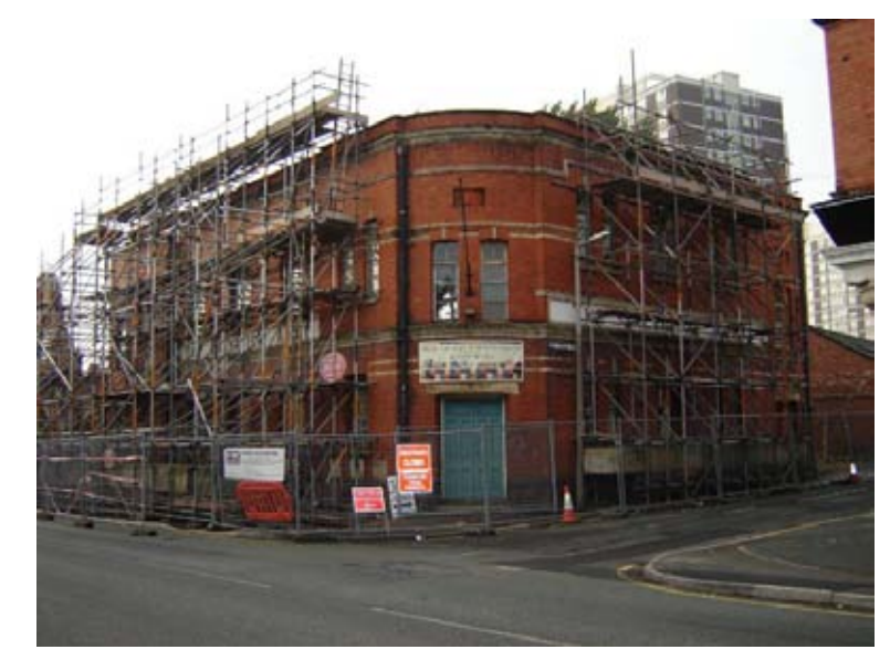
Salvation Army Citadel, Middle Hillgate