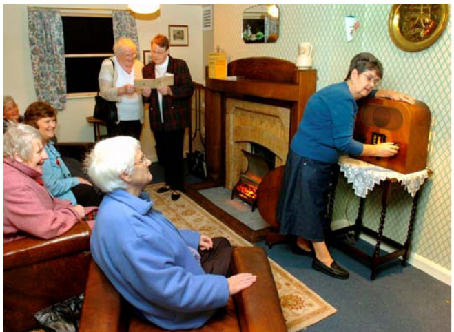
Collections in use: WWII living room on display in The Stockport Story Museum