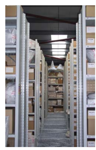
New Improved Storage for reserve collections

The council is always looking for new ways to make its Heritage Collections more accessible. The new Stockport Story Museum in the Market Place (part of the Shawcross Fold Regeneration Scheme) now provides more than three times the space formerly available for the display of local history and more objects than ever are now on display. There's also a new temporary exhibition area, where items from the reserve collections (now in much improved storage facilities) can be shown in a changing selection of themed displays.