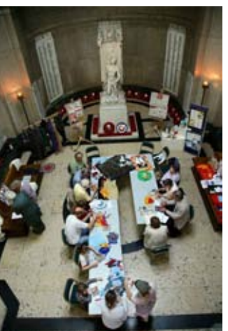
War Memorial & Art Gallery