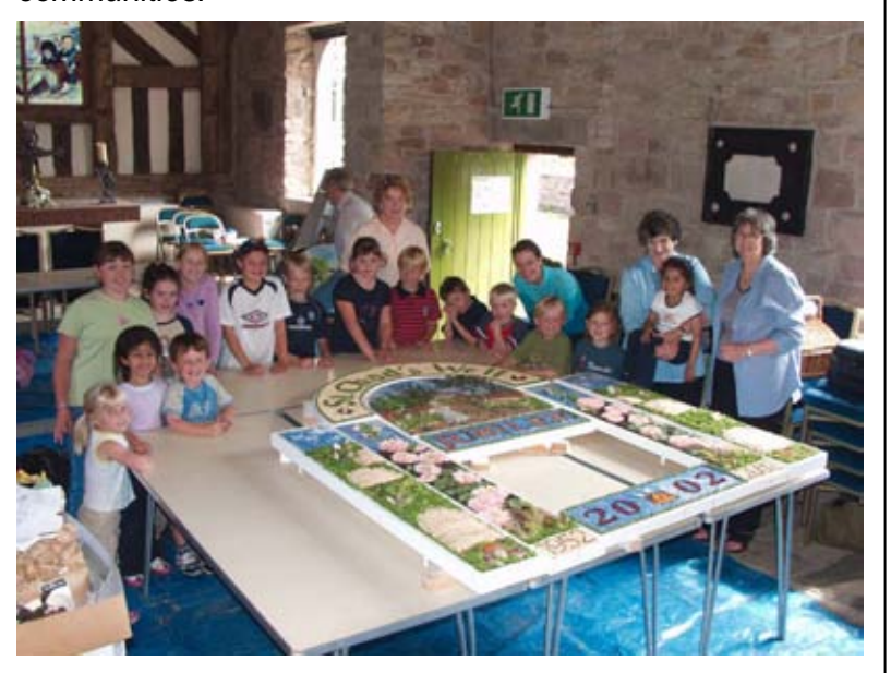
Well Dressing at Chadkirk: Supported by the Friends of Chadkirk

The Council works in partnership with a number of friends organisations, particularly in parks. Friends groups lead on projects and/or support Council initiatives. Friends groups can make HLF bids in their own right, as at Chadkirk Country Estate and Heaton Moor Park and are supported by council officers or they can act in a supporting role to Council Projects, as at Vernon & Woodbank Parks and Bramall Hall & Park. Friends groups help with funding of projects, staffing of events, marketing and publicity initiatives and generating new ideas to involve communities.