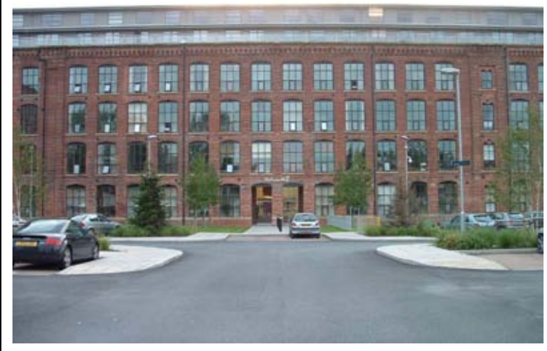
Best Residential Conversion - Victoria Mill, Reddish

The judging panel applauded the quality of the entries and consisted of representatives from English Heritage, CABE, Stockport Heritage Trust, Stockport Civic Society and Stockport Council.