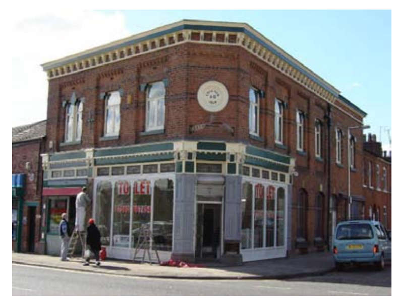
The old Co-op building, Higher Hillgate

Several key schemes have been identified as being vital to the success of the regeneration of Hillgate, and the Council is working closely with development partners to deliver these. The objective is to secure a long term, sustainable future for key building groups within the THI area which are of importance due to their historic value and position as landmark buildings within the conservation area. Amongst these are 27 Higher Hillgate, the Salvation Army Citadel, the former Peaches Nightclub and adjoining buildings.